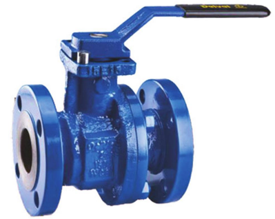
DelVal® Series F